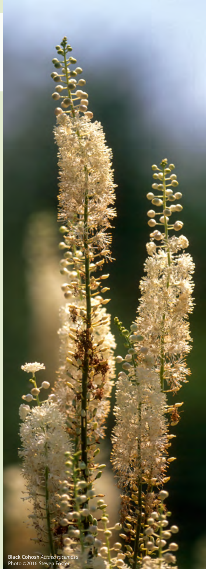
Black Cohosh Actaea racemosa