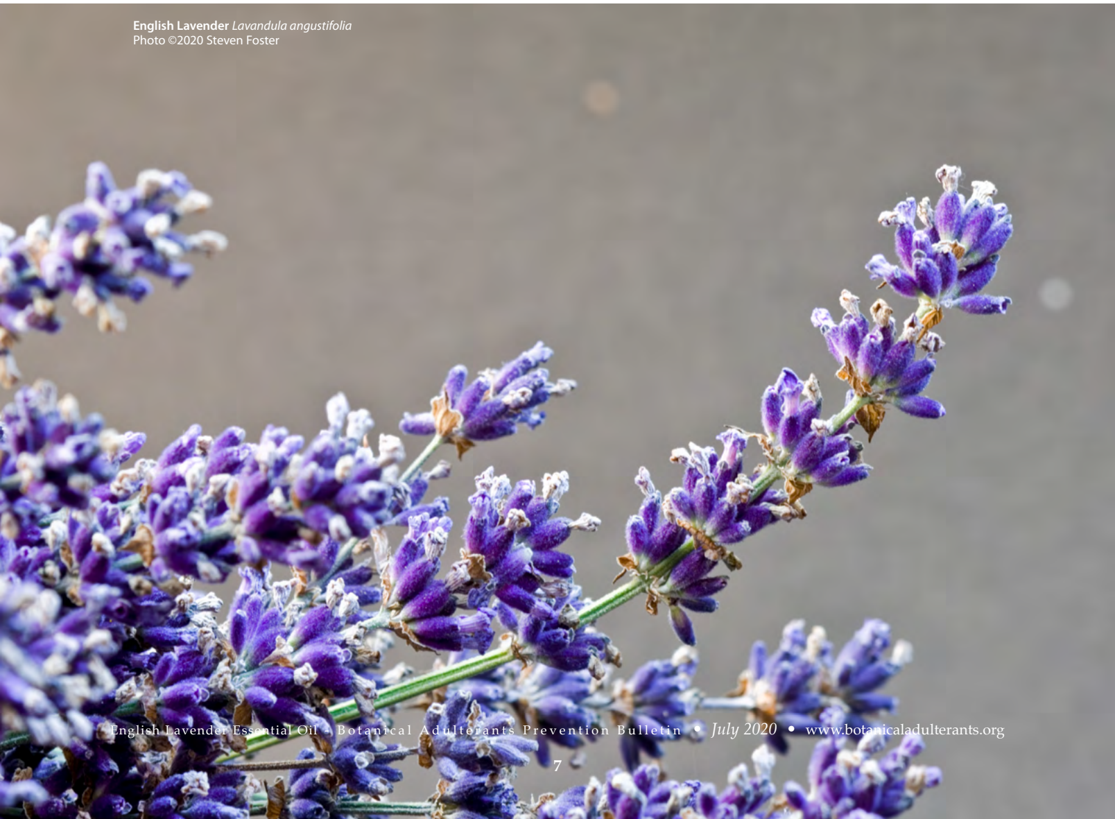
English Lavender Lavandula angustifolia

So far, there is no conclusive, significant evidence that skin sensitizations are specifically due to adulterated ingre-