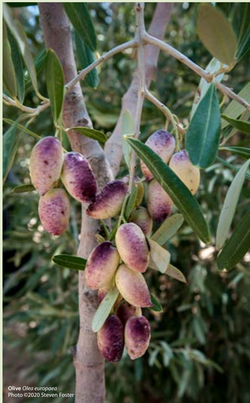
Olive Olea europaea

Olive: Olive is the fruit of the olive tree ( Olea europaea , Oleaceae). The fruit is an oval-shaped drupe composed of a pericarp (skin and flesh) and the endocarp (seed or pit). The seed contributes 15-30% of the weight of the olive depending on the cultivar. The olive contains around 50% water and 20% oil, although these proportions vary widely among olive cultivars and the environmental conditions in which they are grown. There are many cultivars grown worldwide and although around 600 can be found in the literature, the precise number is unknown. IOC has published a World catalogue of