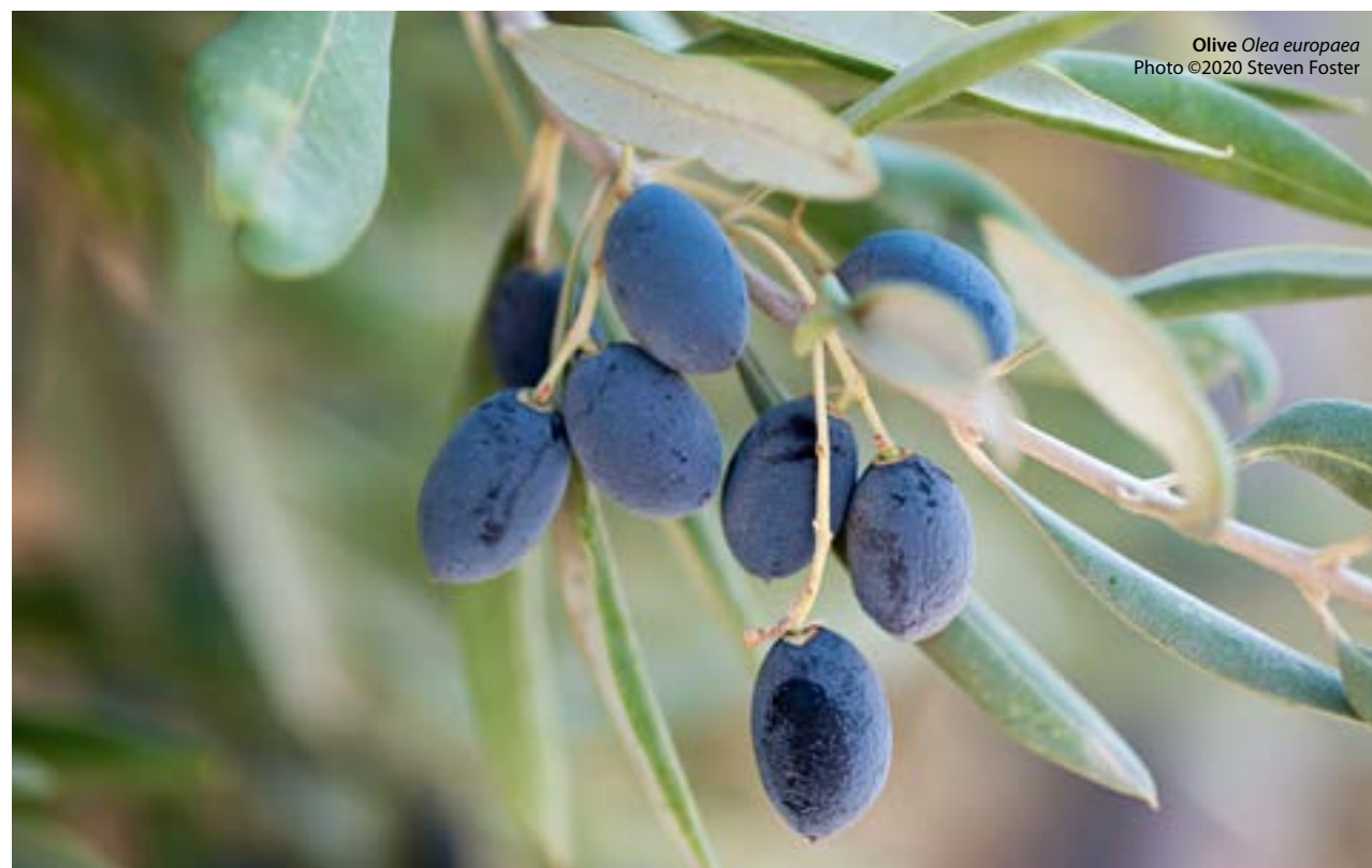
Olive Olea europaea